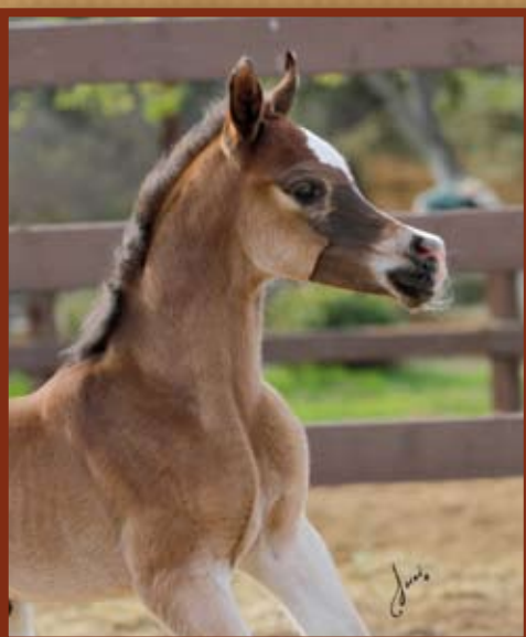
Straight Egyptian colt by Al Rabeb AA out of an Al Baraki daughter bred by Raymond Mazzei, Furioso Farms.