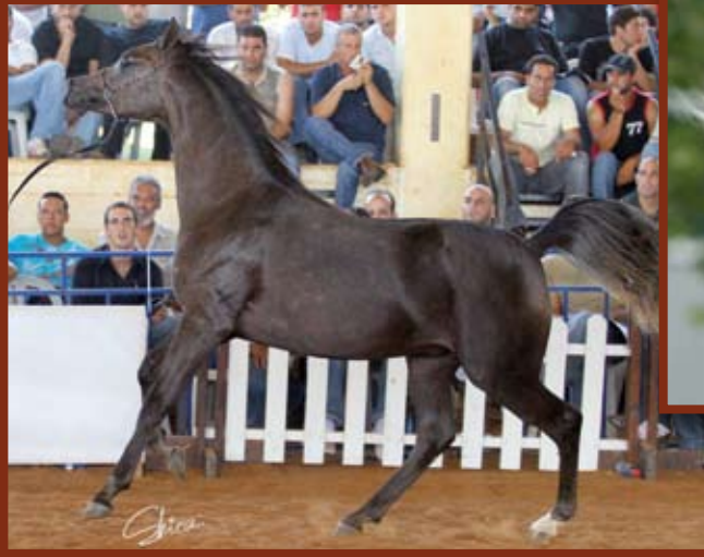
Al Raheb as a foal at the 2006 Israeli Egyptian Event