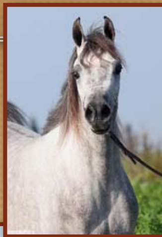
The exotic 2009 Al Rabeb filly AUSTORA AL FAWAZ out of HV Ramses Mashallah, owned and bred by Al Farwaz Stud.