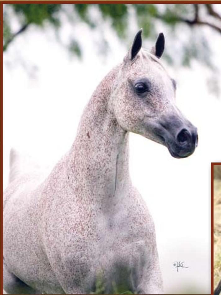
The pure Polish mare EUSCERA (Emigrant x Elcantara by Pamir), owned by Valley Oak Arabians in California, is in foal to Al Rabeb for 2012.