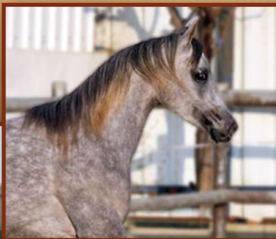
The extremely refined 2009 Al Rabeb daughter RAWAA AL FAWAZ out of Qatifa Sitara, bred by Al Farwaz Stud and owned by Moataz Younis.